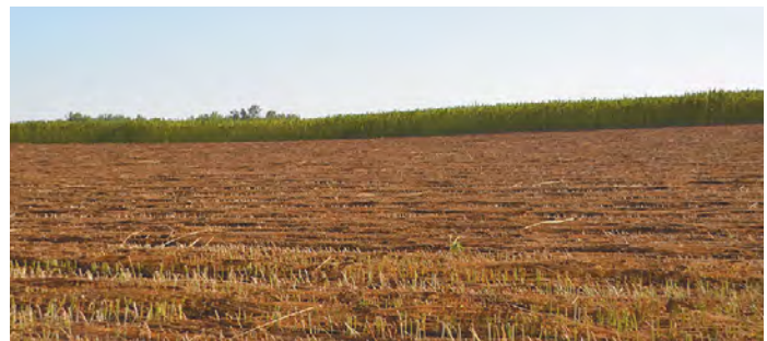
Hemp growing and retting hemp side by side

Active projects in Alberta include fibre mats for automotive interior panels and hempcrete construction blocks. Internationally, hemp is becoming a mainstream fibre in many domains. For example, Nike uses hemp fibres in its running shoes. There are several Canadian companies—including Hemp Oil Canada Inc., Hempola Valley Farms, Fresh Hemp Foods Ltd., Ruths